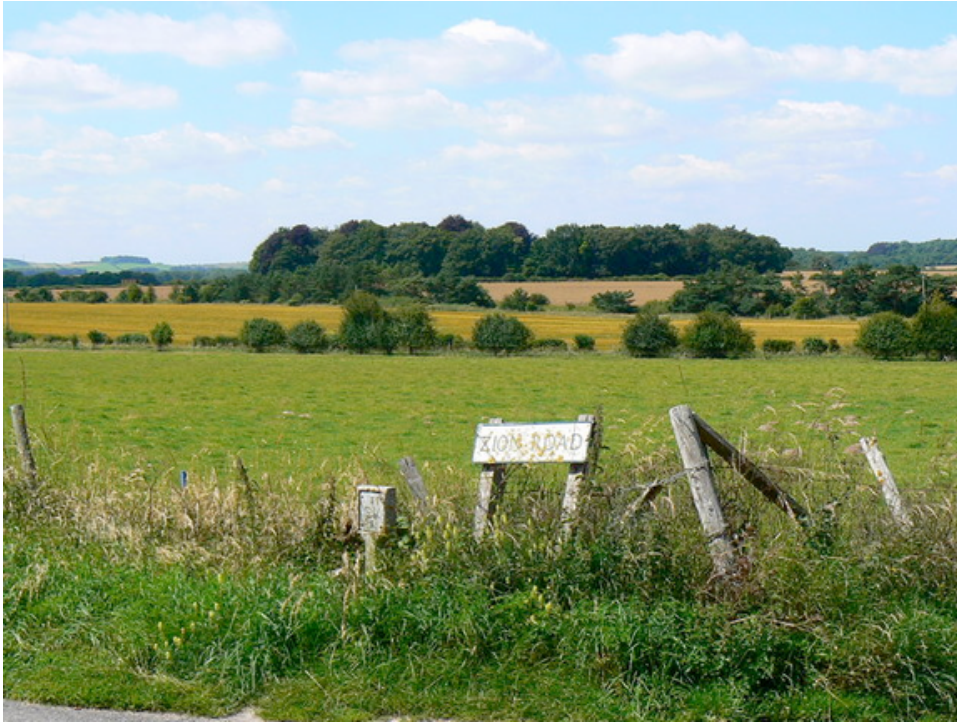
"Zion Road, Palestine"