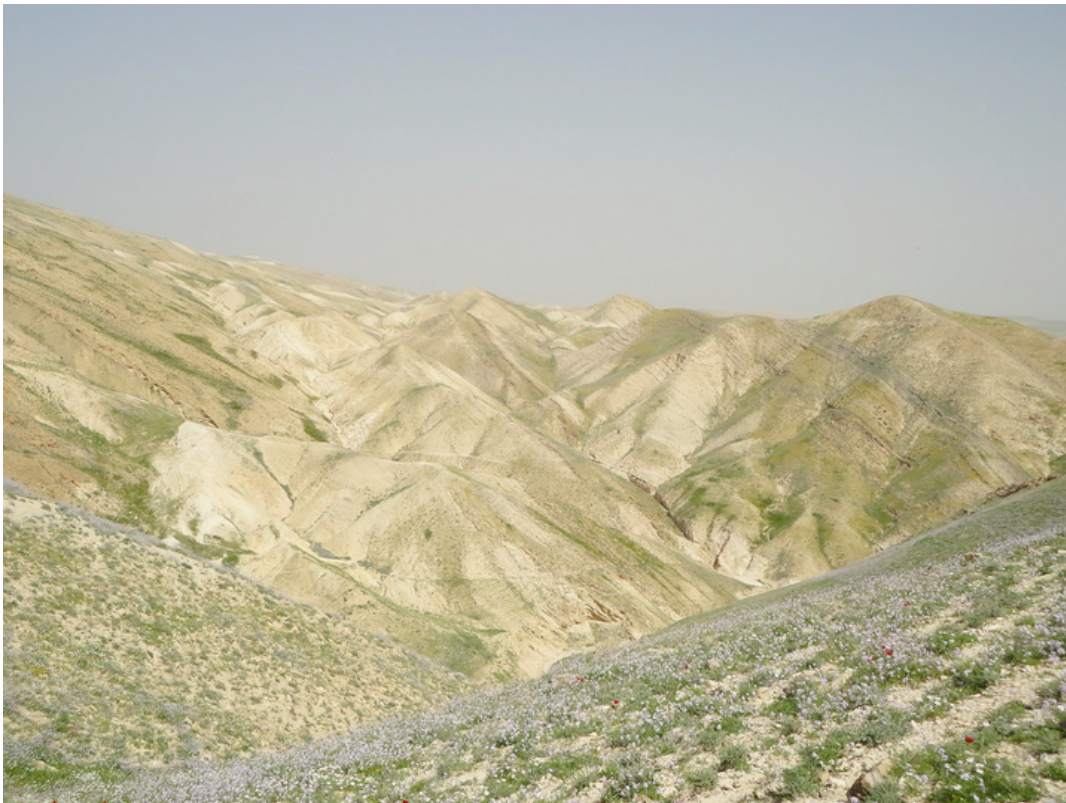
"Westbank landscape" by Heinrich Böll Foundation