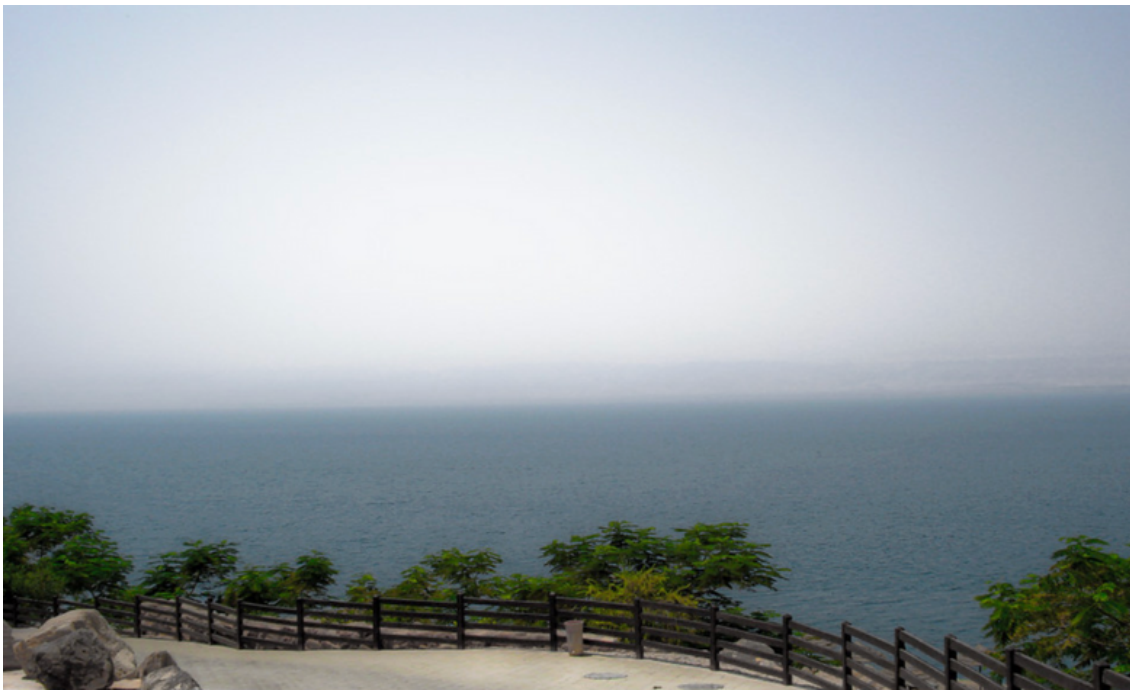
"Palestinian Landscape" by Iman Mosaad