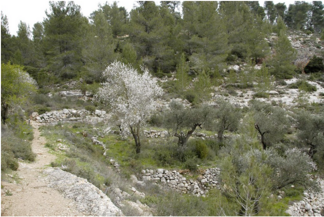
"Almond blossom in Palestine" by Yuri Virovets